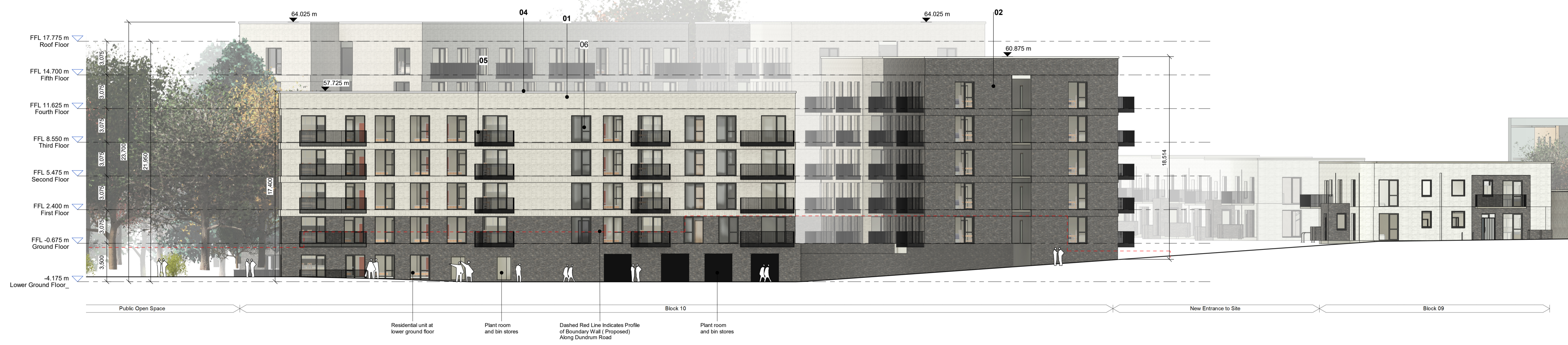
West Elevation 1 : 200

Notes: - Do not scale from this drawing. Use figured dimensions in all cases. - Verify dimensions on site and report any discrepancies to the Architect immediately. - This drawing is to be read in conjunction with the Architect's Specification. - © This drawing is copyright and may only be reproduced with the Architect's permission.