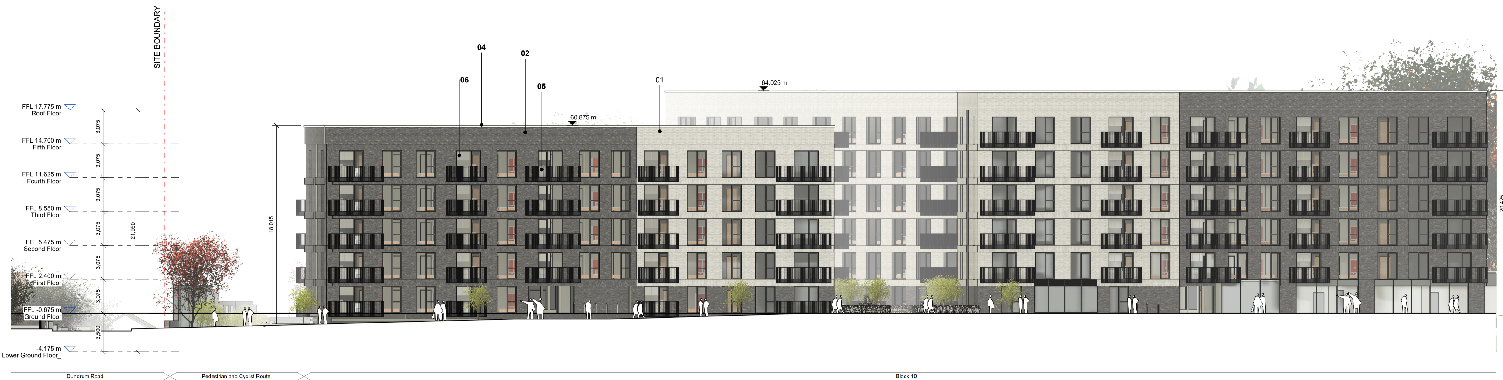
South Elevation 1 : 200